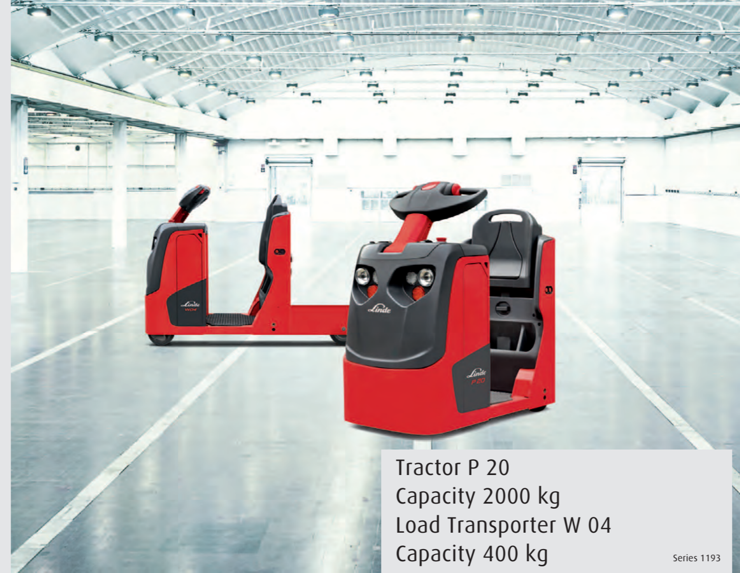
Tractor P 20 Capacity 2000 kg Load Transporter W 04 Capacity 400 kg